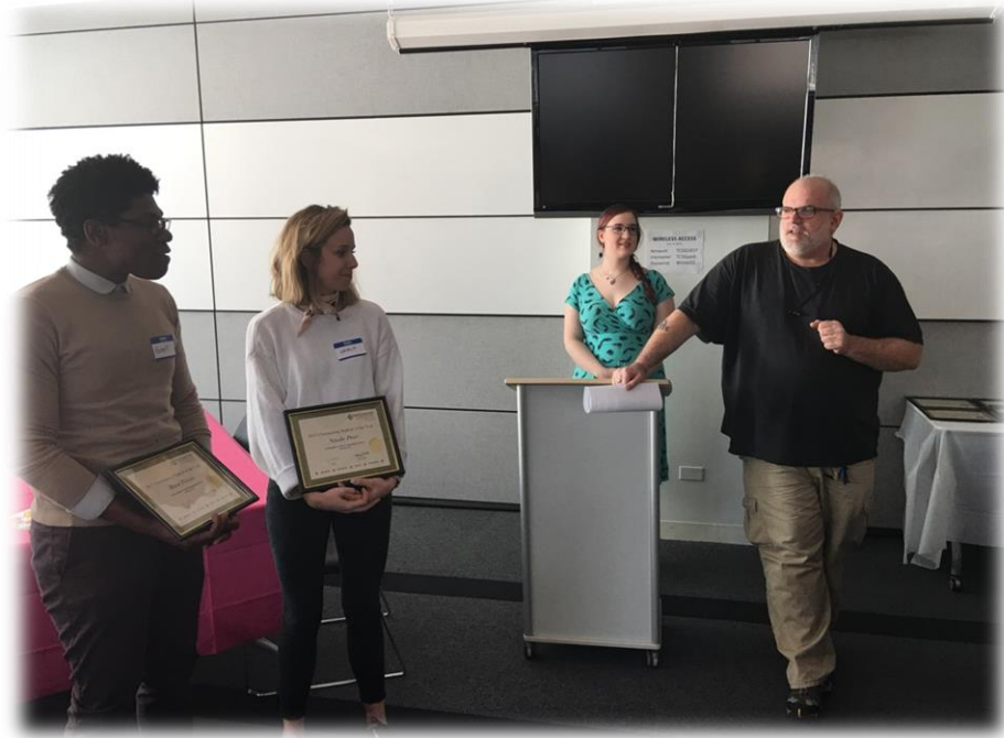
Become Inc. recognizing students at the Annual Awards Ceremony.